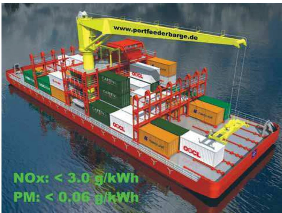
The Port Feeder Barge has very low emissions